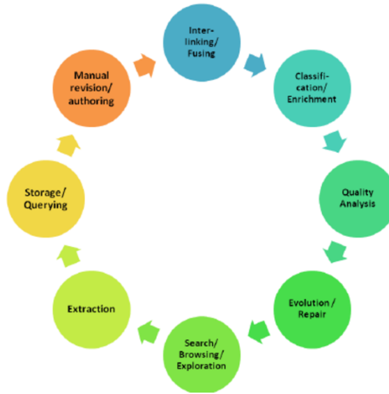
Figure 1: Linked Data Life-Cycle

by means of users. At the same time, this data must be linked to related data from different publishers, as required by Linked Data principles. Since Linked Data tries with raw data, approaches for classification and enrichment must be also provided in order to make efficient queries. Once problems are detected after analysing quality, strategies to repair them are required together with other strategies to support evolution. Finally, the life-cycle proposes to empower users by means of mechanisms to browse, search and explore its structured data in a friendly manner.